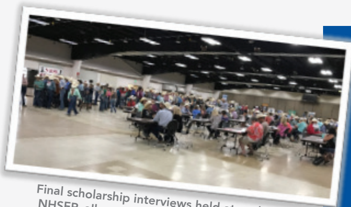
Final scholarship interviews held at each NHSFR—all get at least one scholarship!